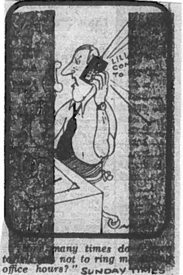
"...many times do not to ring me office hours?" SUNDAY TIMES